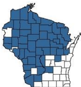
Counties with documented locations of wood turtle in Wisconsin.

Wildlife Action Plan: Species of Greatest Conservation Need