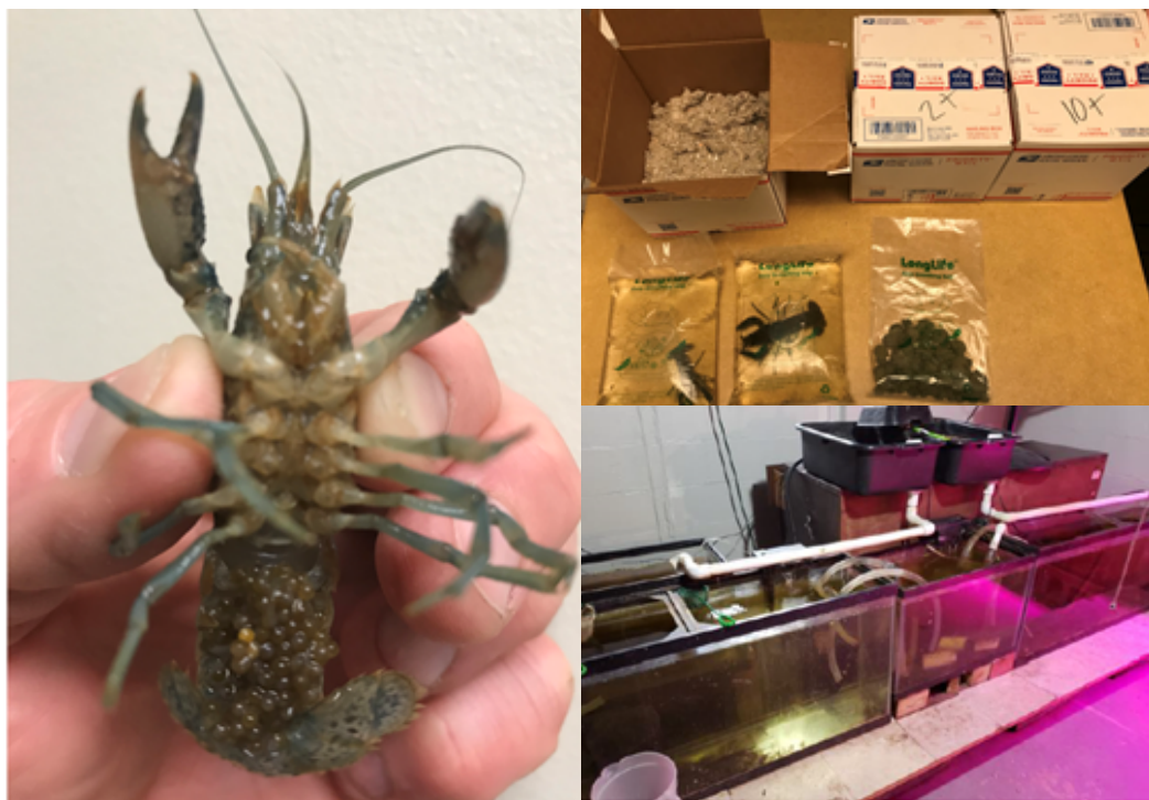
A close up of a marbled crayfish carrying over 100 eggs, marbled crayfish packaged for sale, and connected tanks in a basement.

Self-Cloning Marbled Crayfish Nationwide Distribution. Conservation Wardens investigated a Green Bay man who was raising hundreds of marbled crayfish in his basement, selling them on eBay, then shipping them around the country through the US Postal Service. Marbled crayfish ( Procambarus fallax forma virginalis ), also known as "Marmorkrebs," are the world's only known self-cloning crayfish. They can reproduce without having to find a mate, therefore the release of a single one of these crayfish can start an entire new population! Wardens notified natural resource agencies in 12 other states where the seller shipped these to, and many of those states began investigations in their own states. This has resulted in the discovery of over 1,000 of these crayfish, with nearly 400 of them in Wisconsin. Many more leads that have not yet been fully investigated by the other states yet. The Green Bay man was convicted on three charges of "possess/transfer Prohibited invasive species."