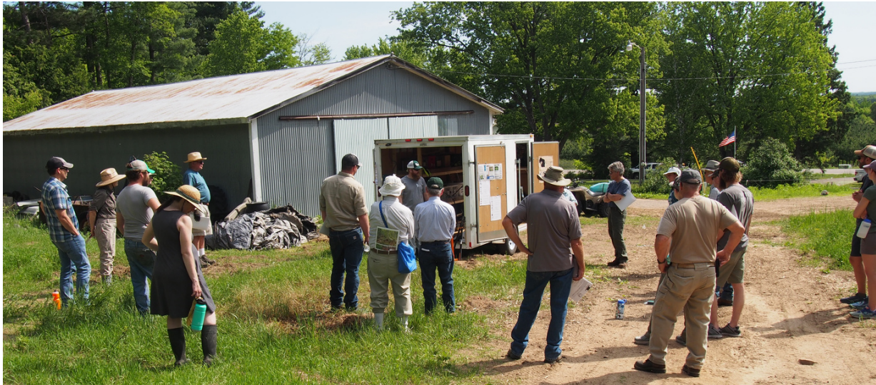
Attendees of a Woodland Management Workshop through the Lower Chippewa Invasives Partnership learn about tools and equipment needed to be successful in landowner invasive species management.

The Weed Management Area-Private Forest Grant Program ( WMA-PFGP) awarded $110,650 to partner groups in fiscal year 2021, which reflects an additional $50,000 from federal grants that were re-allocated to this program.