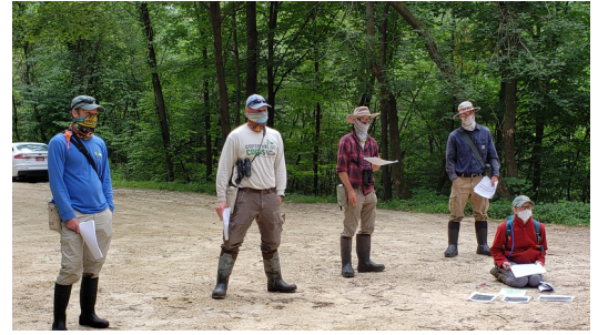
A State Natural Areas (SNA) team is trained to identify stilt grass with COVID19 precautions in place.

Virtual, But Valuable. In May 2020, webinar training sessions were hosted to review topics ranging from species identification, to monitoring and reporting, to disinfection. In spring 2021, meetings took place to review previously recorded webinars, provide additional webinar training sessions, and answer questions. When in-person training was not possible, the DNR adapted in order to continue invasive species monitoring programs. All webinar recordings are available to the public on the DNR webpage: https://dnr.wisconsin.gov/topic/Lakes/AIS/Monitoring.html