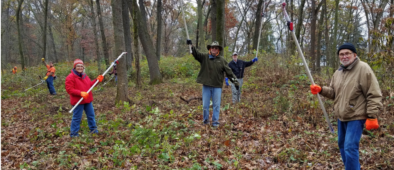
Members of the Friends of the Lower Wisconsin Riverway treat invasive brush and brambles at the Twin Lizard effigy mound group.

Woodlot and forest landowner participation is critical for prevention and management of invasive forest pests and diseases. To assist woodlot owners, the DNR has developed guidance on prevention and management of some of the most damaging invasive forest pests and diseases.