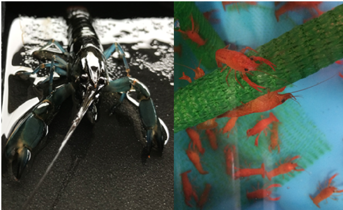
Prohibited invasive crayfish sold as pets. On left: Thunderbolt crayfish. On right: Neon Red crayfish.

Operation Crusty Crab. Conservation Wardens investigated a citizen complaint about an invasive red swamp crayfish for sale in a Milwaukee pet store. The investigation revealed that several wholesale pet distributors had provided around 900 invasive crayfish to pet stores throughout Wisconsin even after some of the distributors and pet stores had been notified of invasive species rules. Dozens of criminal and civil charges have been filed throughout Wisconsin for the more egregious violations, along with hundreds of warnings.