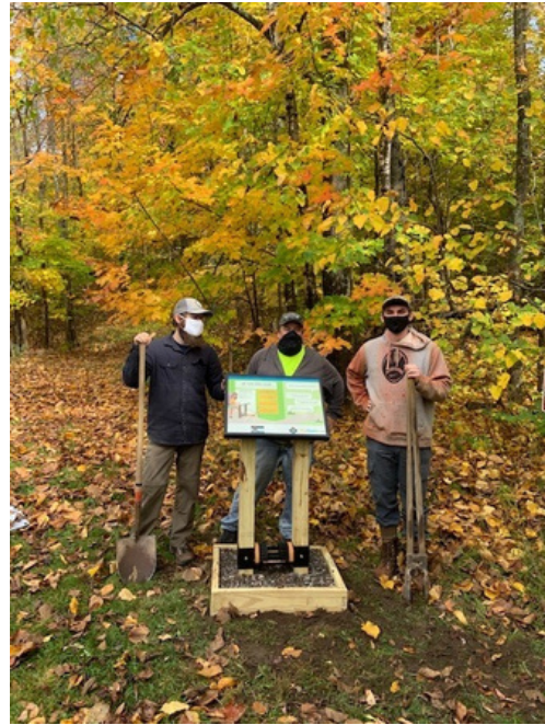
A new boot cleaning station is installed.

PlayCleanGo. The Department of Natural Resources partnered with the North American Invasive Species Management Association (NAISMA), regional CISMAs, county governments, and nature centers to identify 65 locations throughout Wisconsin for the installation of PlayCleanGo boot brush kiosks. PlayCleanGo promotes awareness, understanding, and cooperation by providing a clear call to action to be informed, attentive, and accountable for stopping the spread of all invasive species. PlayCleanGo engages outdoor enthusiasts where they recreate to encourage active invasive species prevention measures such as cleaning outdoor recreation gear (boots, bikes, boats, and more) before entering a recreation area through a trail, boat landing or other pathway.