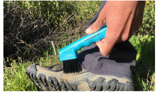
A boot brush is used to clean dirt and seed from boots.

https://dnr.wi.gov/topic/ForestHealth/staff.html