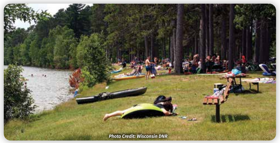
Pack a picnic and catch some rays at Crystal Lake Beach.

A vehicle admission sticker is required on all motor vehicles within the campgrounds at Northern Highland-American Legion State Forest.