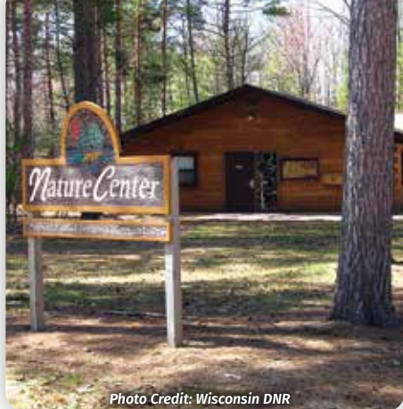
Fall camping at Crystal Lake Campground.