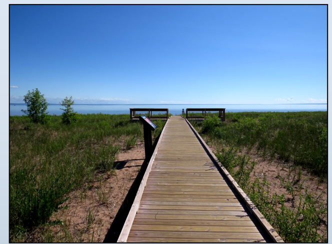
Top: Boardwalks provide beach access and allow re-established dune grass to cover the dunes.