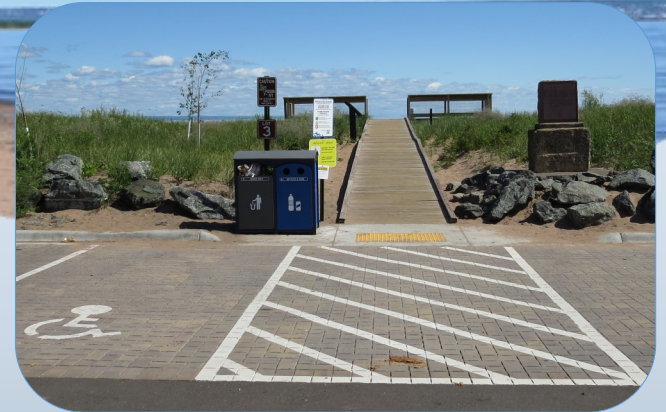
Improved accessible parking and boardwalks

Prior to restoration, the dunes were crisscrossed with trails, inhibiting vegetation growth