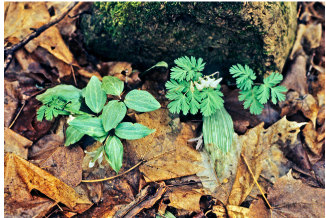
This rich maple-basswood forest on slopes above the Rush River in Pierce County supports a high diversity of herbs, including snow trillium (Wisconsin Threatened), putty-root (Wisconsin Special Concern) and Dutchman's breeches. Western Coulees and Ridges Ecological Landscape.

Warbler ( Setophaga citrina ), Kentucky Warbler ( Geothlypis formosa ), Yellow-throated Warbler ( Setophaga dominica ), Worm-eating Warbler ( Helmitheros vermivorum ), Louisiana Waterthrush ( Parkesia motacilla ), and Acadian Flycatcher ( Empidonax virescens ). Other birds breeding in southern Wisconsin's mesic hardwood forests are Wood Thrush ( Hylocichla mustelina ), Scarlet Tanager ( Piranga olivacea ), Pileated Woodpecker ( Dryocopus pileatus ), Blue-gray Gnatcatcher ( Poliophtila caerulea ), Barred Owl ( Strix varia ), and Red-shouldered Hawk ( Buteo lineatus ).