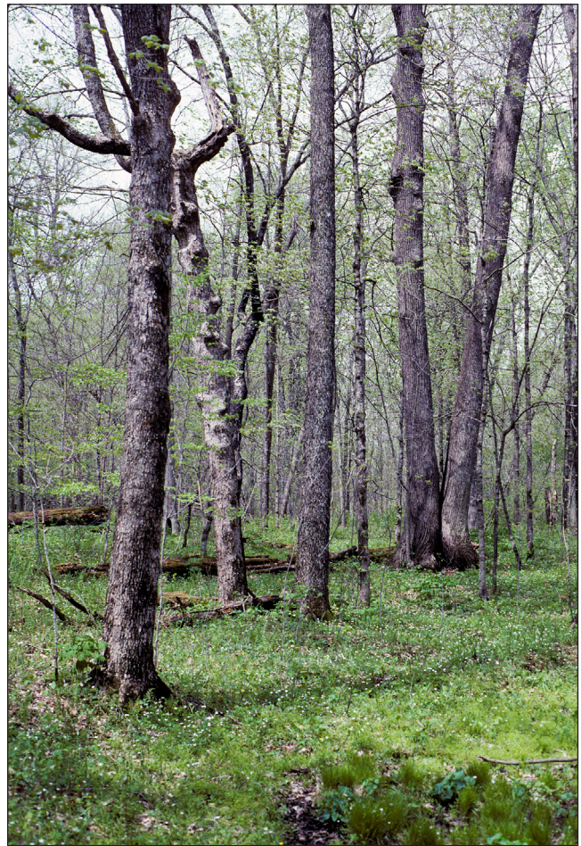
Diverse old stands of sugar maple-basswood forest on an alluvial terrace just above the floodplain of the Black River. This stand supports not only a diverse herbaceous layer but several rare animals as well. Black River State Forest, Jackson County, Central Sand Plains Ecological Landscape.