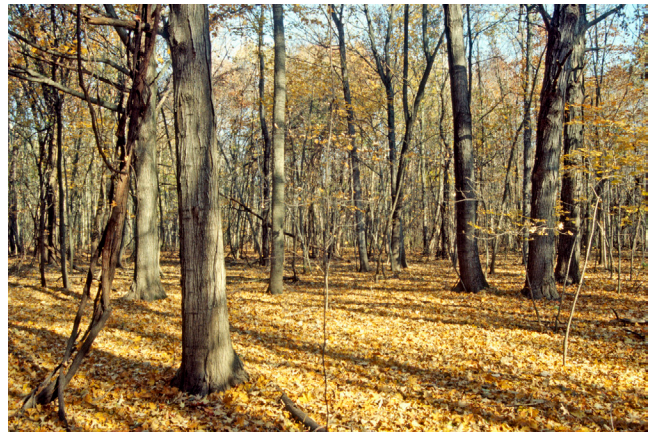
Remnant mesic hardwood forest in Milwaukee County is dominated by large oaks, maples, American basswood, and American beech. Few such remnants persist in the southeastern corner of the state, all are small and isolated, and most are fragments of formerly much more extensive forested areas. Southern Lake Michigan Coastal Ecological Landscape.

The rare animals found in southern Wisconsin hardwood forests include a number of area-sensitive species that are either absent from or of very limited distribution in the far more extensive forests of northern Wisconsin. This group includes Cerulean Warbler ( Setophaga cerulean ), Hooded