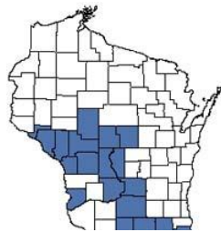
Eastern Massasauga Historic Range

The eastern massasauga is state endangered and proposed as federally threatened. This species is extremely rare and remains at only 9 sites within its historic range. It is illegal to collect, possess or kill this species.