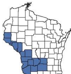
Timber Rattlesnake Range

The timber rattlesnake is a protected wild animal, meaning it is illegal to collect, possess or kill this species except in cases where there is an immediate threat to humans or domestic animals.