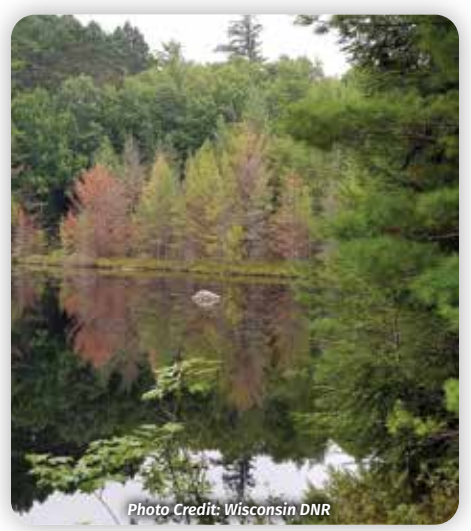
Take in the scenic shoreline views on Firefly Lake.

A vehicle admission sticker is required on all motor vehicles within the campgrounds at Northern Highland-American Legion State Forest.