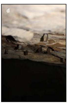
Figure 3. Inhabited summer roost habitat in Wisconsin (Photos a,b). The dark color of the bat houses helps them heat up during the day, and bat houses retain the heat after the sun sets (b). Little brown bats using a bat house in Lafayette County (c), © Kent Borcherding, and Yellowstone Lake State Park bat houses in Lafayette (b), © Kent Borcherding. A little brown bat hibernaculum (mine) in Pierce County (Photos c,d). Large room with clusters (c), Heather Kaarakka, Wisconsin DNR, and single bats hanging from ceiling (d). Tyler Brandt, Wisconsin DNR

Edge habitat (transition zone between two types of vegetation) is important for little brown bats as they migrate and forage. When bats migrate from wintering caves to summer habitat, or commute from roosts to feeding grounds, they move through the landscape in a manner that protects them from wind and predators. Instead of flying the shortest distance across a field, for instance, bats will take longer routes that follow edge habitat. In addition to offering protection, this behavior may also allow bats more feeding opportunities because food is more abundant around edge habitat (Limpens and Kapteyn 1991). Commuting along edge habitat may assist the bats with navigation and orientation through use of linear edges as landmarks (Verboom and Huitema 1997).