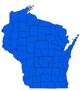
Range of little brown bat in Wisconsin.

Wildlife Action Plan Area of Importance Score: None