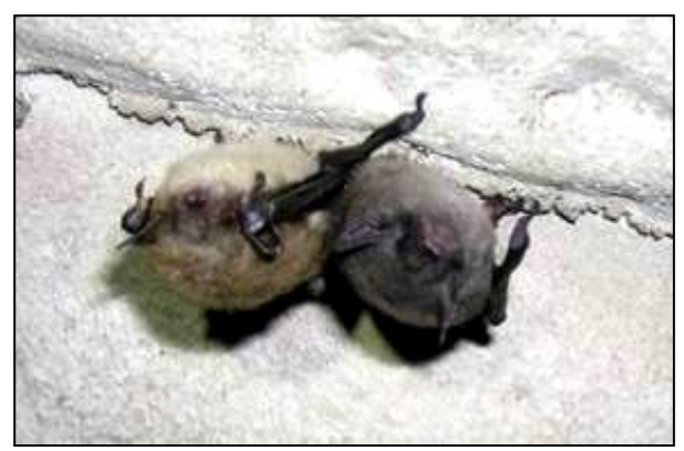
Figure 1. Little brown bat (left) and Indiana bat (right). The little brown bat has a brownish color and a light ventral side. Dave Redell, Wisconsin DNR

Similar Species: Three bat species in Wisconsin – the little brown bat, the northern long-eared bat ( Myotis septentrionalis ) and the Indiana ( Myotis sodalis ) bat – are best distinguished by close (in-hand) inspection. The northern long-eared bat has longer ears than the little brown bat, and a pointed, spear-like tragus. Tips of little brown bat ears, when ears are folded alongside the head, should extend no more than 3 mm beyond the tip of the nose; in contrast, the northern long-eared bats' ears extend 3 mm or more. Little brown bat ear length in Wisconsin, however, can be highly variable, and tragus shape and length in relation to the rest of the ear are the two best features to use to distinguish these two species. The little brown bat also appears similar to the Indiana bat, but the little brown bat has long toe hairs that extend beyond the toe, and also lacks the Indiana bat's keeled calcar, a spur of cartilage extended from the ankle and supporting the interfemoral membrane (Barbour and Davis 1969, Fenton and Barclay 1980). Little brown bat fur is also generally glossier and lighter-colored than that of the grayer Indiana bat (see figure 1). The little brown bat can also be identified by its echolocation call (figure 2), but northern long-eared and Indiana bats share similar call characteristics and only trained individuals should positively identify bat species through echolocation calls.